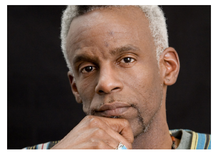
BlackNation5.jpg Cardinal Mbiyu Chui.