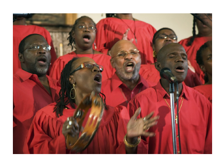
BlackNation4.jpg The choir of the Shrine of the Black Madonna: The Nationnaires.