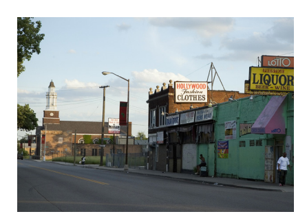
BlackNation2.jpg Shrine of the Black Madonna, Detroit, Michigan